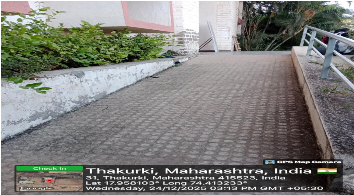
RAMPS FOR PHYSICALLY DISABLED