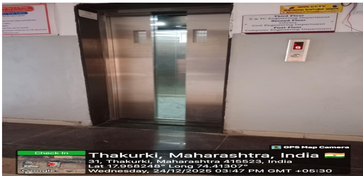
LIFT FACILITY FOR DIVYANGJAN